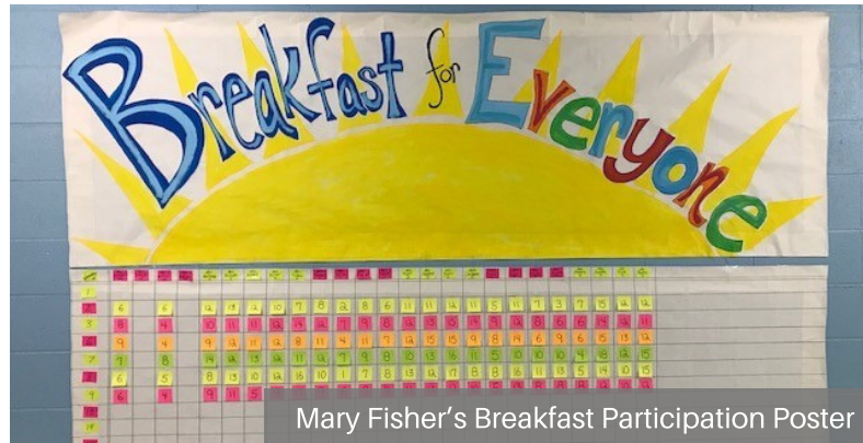
Mary Fisher's Breakfast Participation Poster